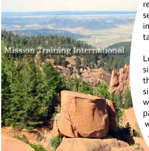
Mission Training International

We also enjoyed fellowship with other missionaries. Brothers and sisters from all over the globe were present. During our group sessions we shared our stories, listened, and wept with one another. To be with others who "get it" ("it" being the missionary life), was a healing balm to our souls.